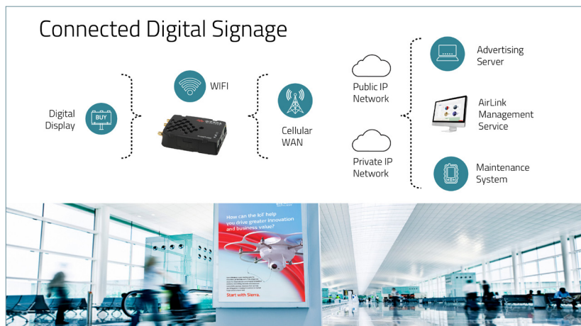
Application Example - Digital Signage